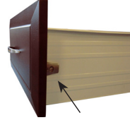
Field Replaceable Drawer and Door Fronts