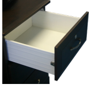
Steel Side Drawer Construction