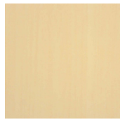
Hard Rock Maple (HM)