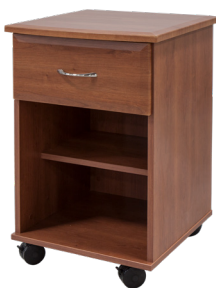
Jasper Series (Laminate)

Amico's bedside cabinets feature contemporary designs and durable construction to meet the demanding needs of today's healthcare environment. Manufactured using seamless thermofoil and high-pressure laminate, these cabinets come with various hardware and drawer front styles to choose from. With different drawer configurations and optional features including casters, drawer liners or spill guard tops, our Bedside Cabinets can be customized to suit any existing décor.