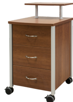
Lucas Series (Laminate or Thermofoil)