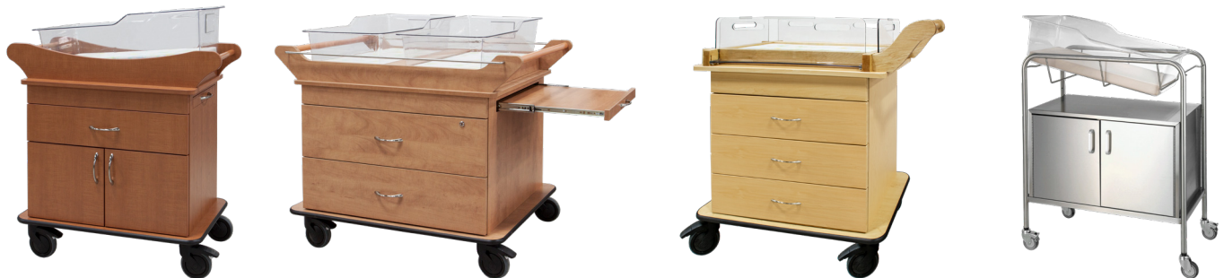
(Single) Marco Series

Amico's Bassinets are crafted using the highest quality materials designed for long lasting durability to create a home-like environment in labor and delivery departments. Available in high-pressure laminate or seamless thermofoil finishes, our bassinets can be customized with various drawer and door configurations, as well as hardware options and additional features for charts and writing surfaces.