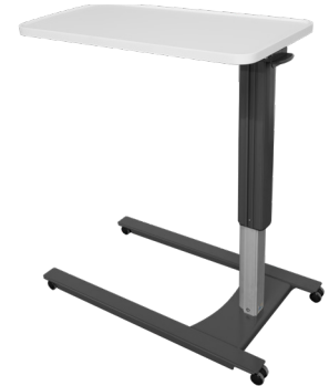
Solid Surface Table (Corian)