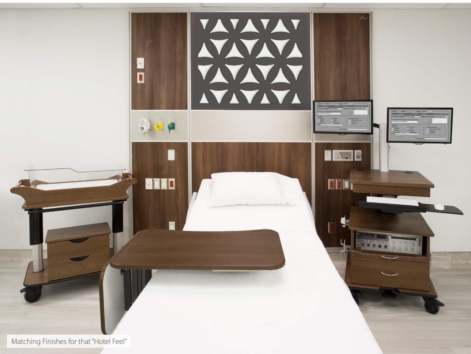
Matching Finishes for that "Hotel Feel"