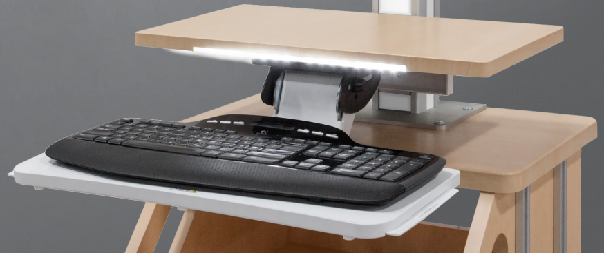
Touchpad Light for Night-time Charting