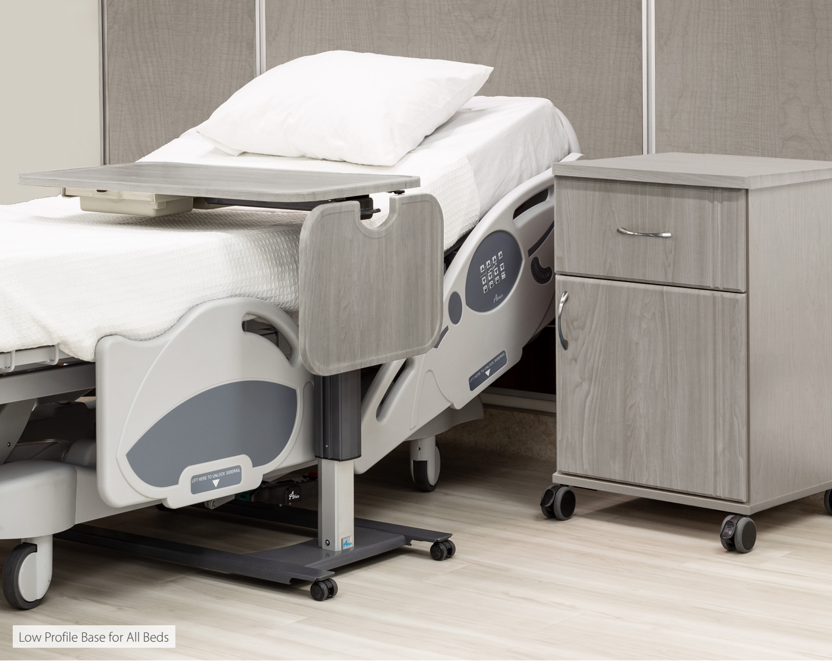
Low Profile Base for All Beds