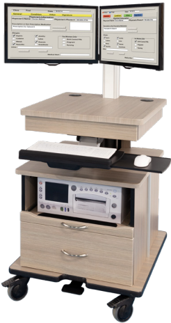
Fetal Monitor Carts

Amico understands that the moment of Labor and Delivery can be stressful. When time is tight, the clinical team needs to be in the best position to care. To help, we created the first series of height adjustable labor and delivery equipment in the market. Our Sit-to-Stand fetal monitor cart allows the nurse to work seated or standing. The height adjustable delivery cart allows for unprecedented nurse and doctor access to really fit into your labor situation. Our fully height adjustable bassinet is not only great for nurse ergonomics, but allows Mom to get close to the baby while in bed, keeping the mother/baby interaction safe and comfortable.