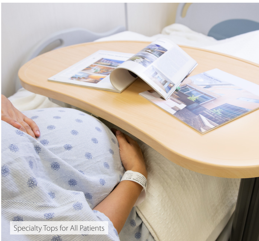
Specialty Tops for All Patients