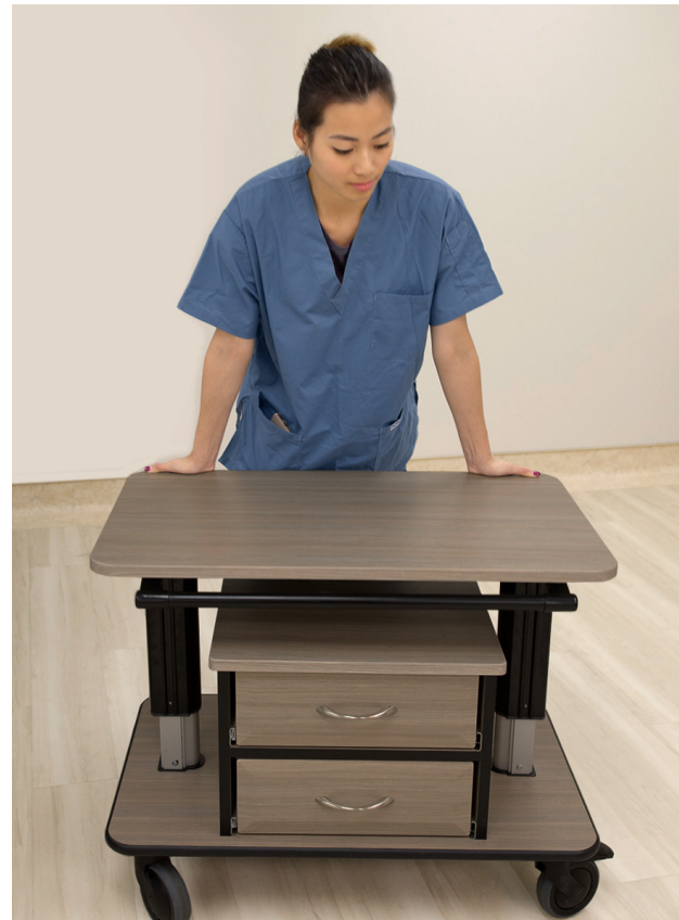
Achieve Your Perfect Working Height