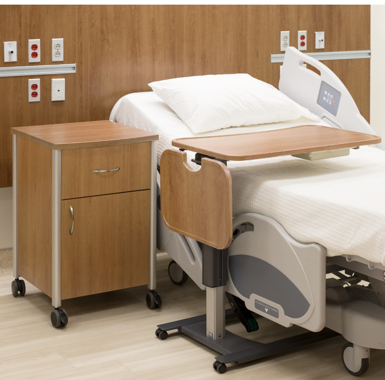
Coordinate with Your Patient Room