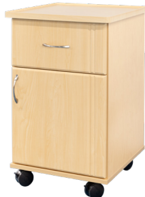
Oliver Series (Thermofoil)