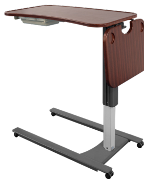
Flip Kidney Table