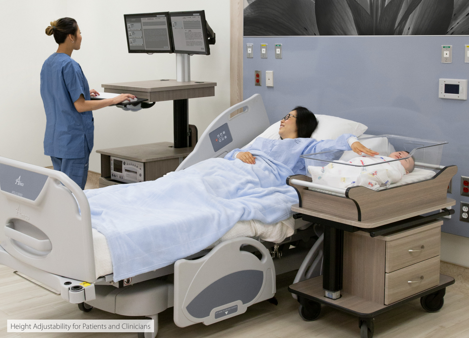
Height Adjustability for Patients and Clinicians