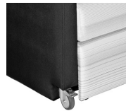
Heavy Duty Casters