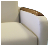
Wood or Black Arm Caps