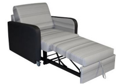
Wall Saver Feature (Sleep surface extends outward while unit remains stationary)