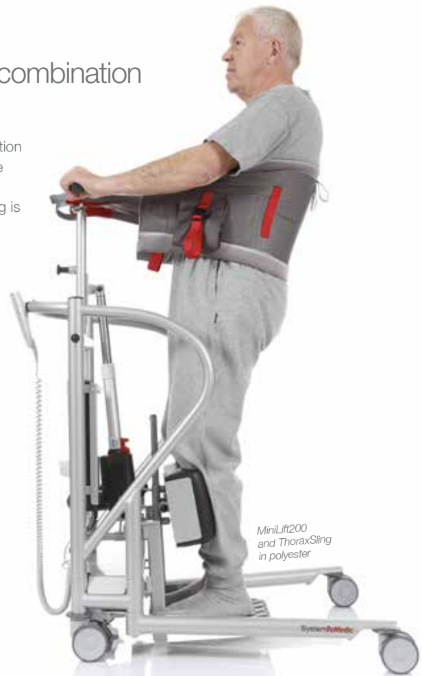
MiniLift200 and ThoraxSling in polyester