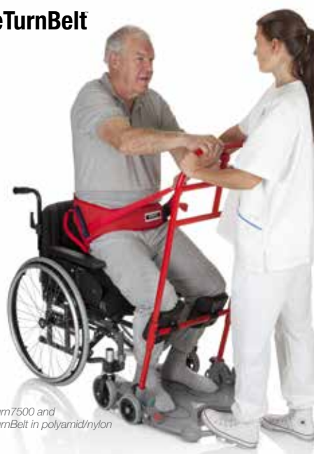
ReTurn7500 and ReTurnBelt in polyamid/nylon

The patented* ReTurnBelt is an excellent complement to Handicare's ReTurn transfer platforms. For users with weak legs and requiring extra support.