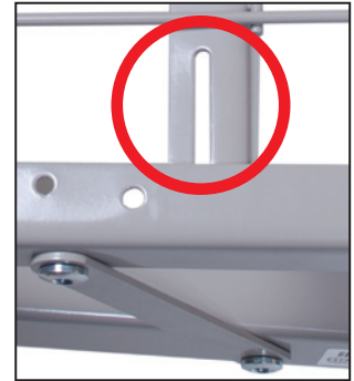
Patent Pending Rail Slots