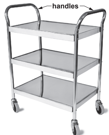
8146 Utility Cart assembled

The Utility Cart may be pushed from either end.