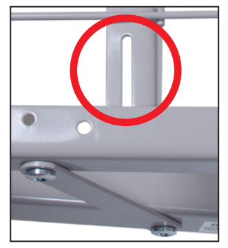
Patent Pending Rail Slots

Specifications are subject to change without notice.