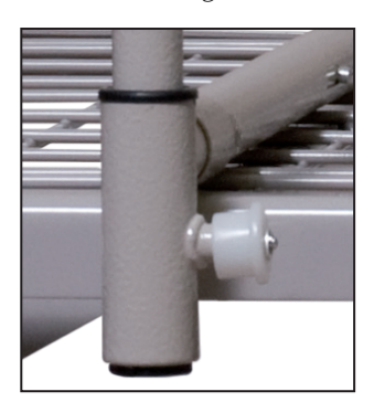
Crossbrace Safety Tab