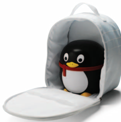
with optional igloo carrying case