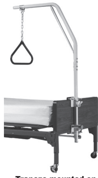
Trapeze mounted on bed headboard