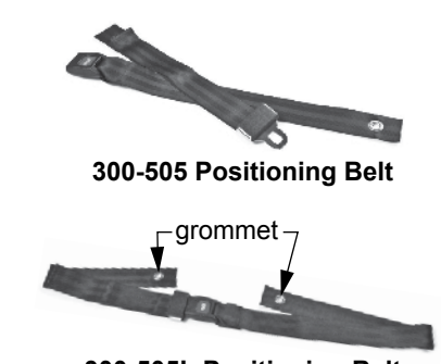
300-505L Positioning Belt