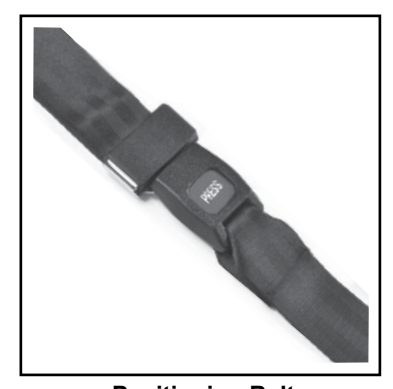
Positioning Belt shown locked