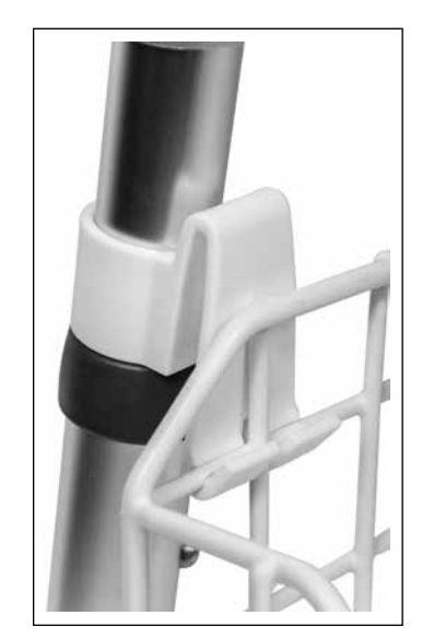
Basket Mounted on Clamp Hooks