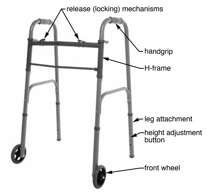
Standard Adult Walker with 5" Wheels

Refer to illustration at right. All four walker legs are equipped with a height-adjustment button and an adjustable leg attachment with several adjustment positions. To adjust leg height, depress the height adjustment button and twist the leg attachment to the desired height. Repeat for other three legs, ensuring that all four legs are adjusted to the same height.