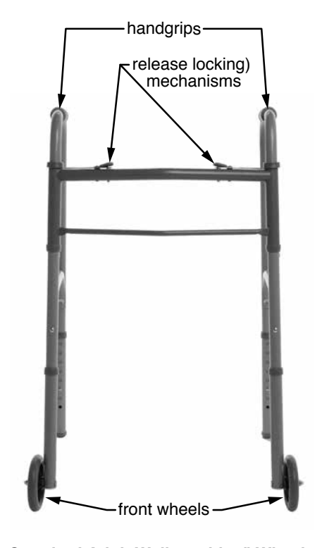
Standard Adult Walker with 5" Wheels