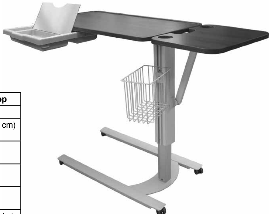
Shown Above: Flip Top Overbed Table with Optional Basket and Optional Vanity Drawer with Mirror

Remove table (shown at right) from carton and protective packaging. Check for obvious damage to the carton or its contents. If damage is evident, do not use the product; notify the carrier and your GF authorized distributor for further instruction.