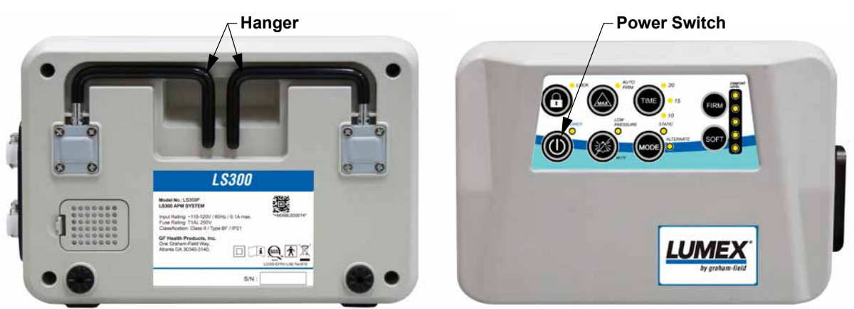
Pump Rear View