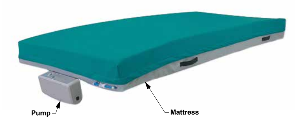
Lumex Select Series Convertible Mattress System