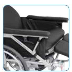
Optional Side Pad set (l&r) Item No. PT3000-SP sold separately